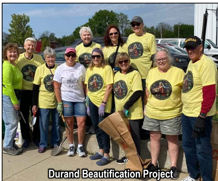
Durand Beautification Project