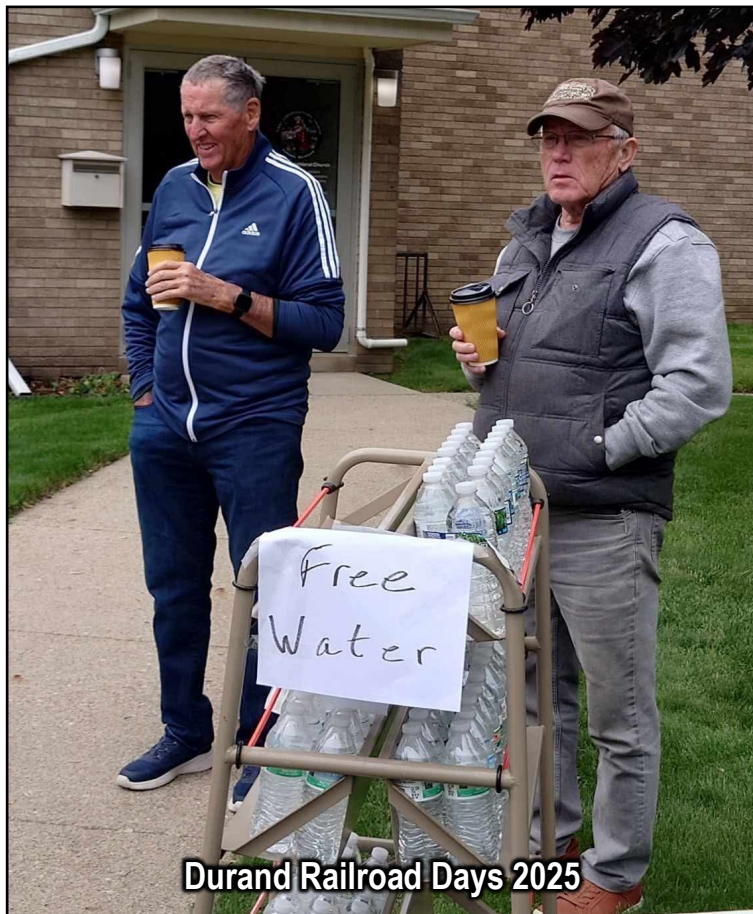
Durand Railroad Days 2025

CONTINUED - see "From the Pastor" on p. 3