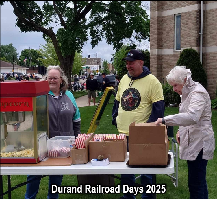
Durand Railroad Days 2025

There is a lesson for us to learn from Jesus in the wilderness. He is not going to prove himself until we believe. That’s why John wrote, “God so loved the world that he gave his one CONTINUED - see “From the Pastor” on p. 2